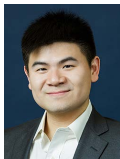
Park Sinchaisri Haas, UC Berkeley