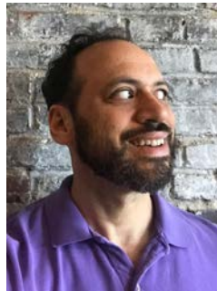
Ethan Mollick UPenn, Wharton